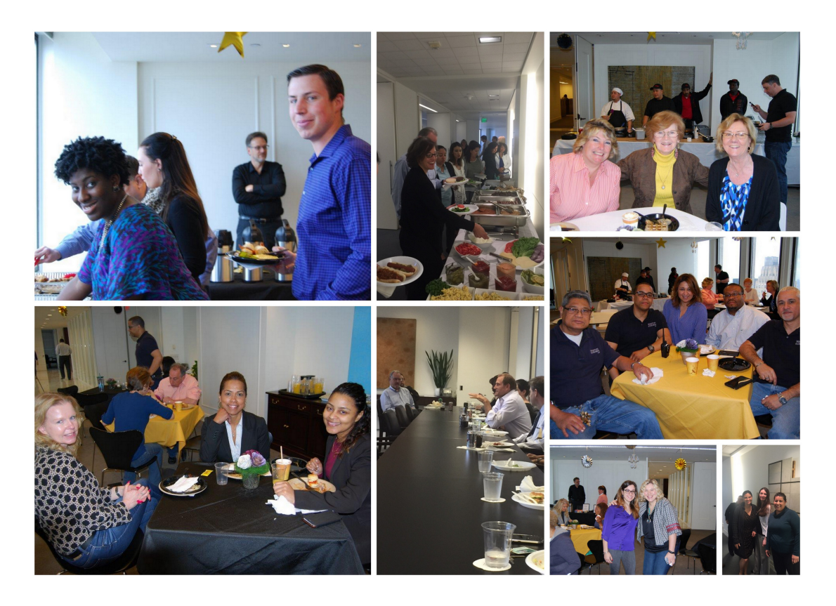
Click <u>here</u> to view more photos from Staff Appreciation Week.