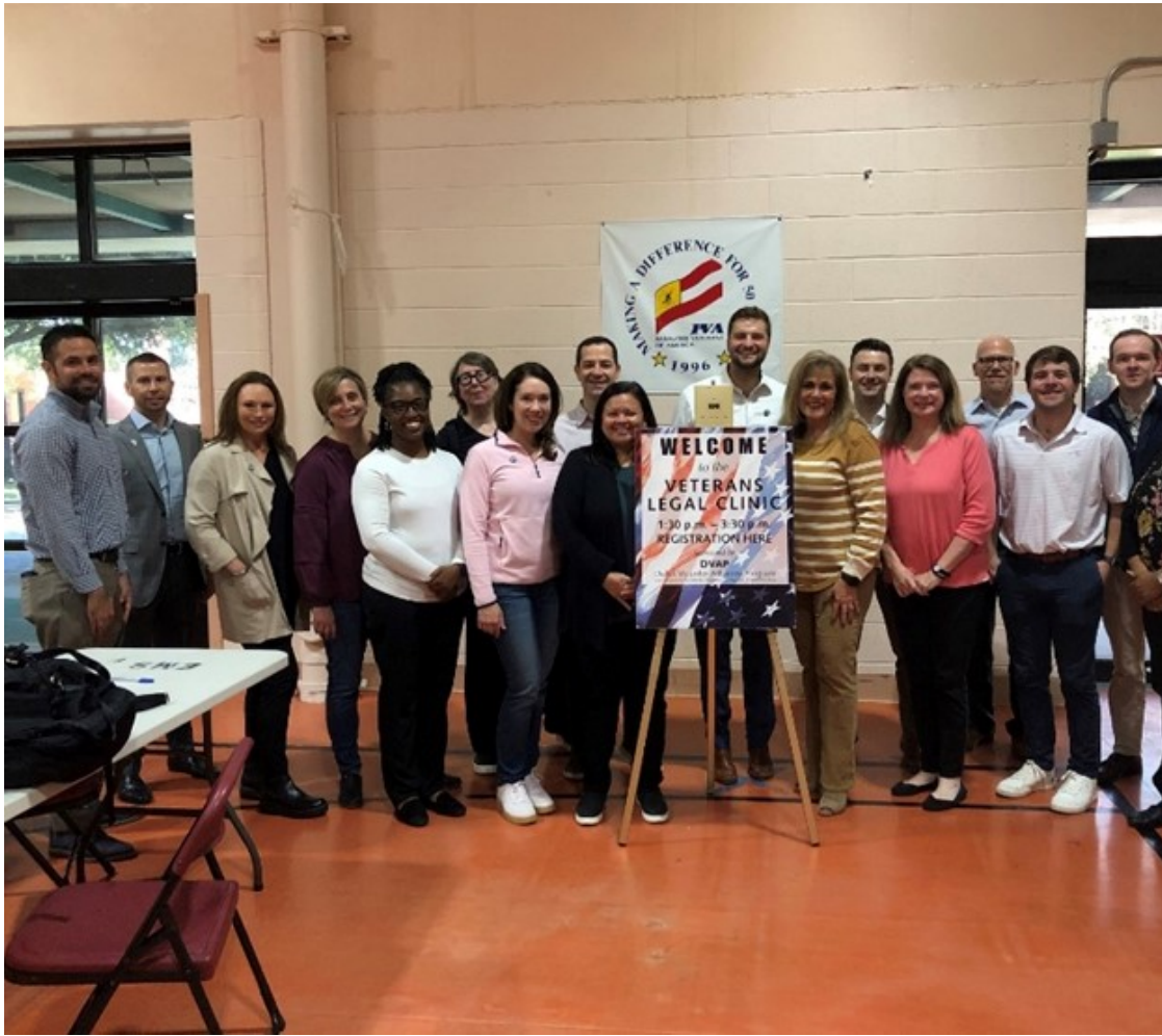
The Winston/Toyota team at the Veterans Legal Clinic