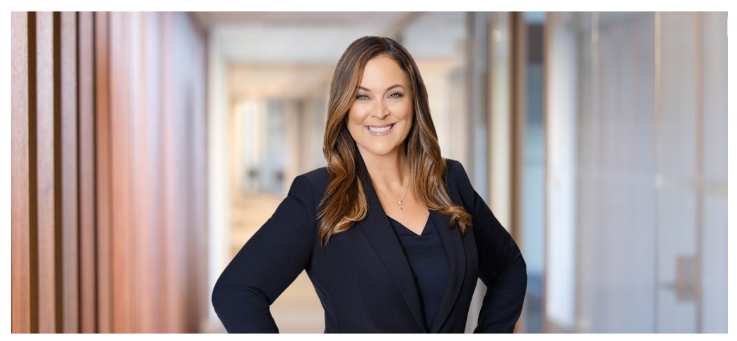
Silicon Valley Business Journal