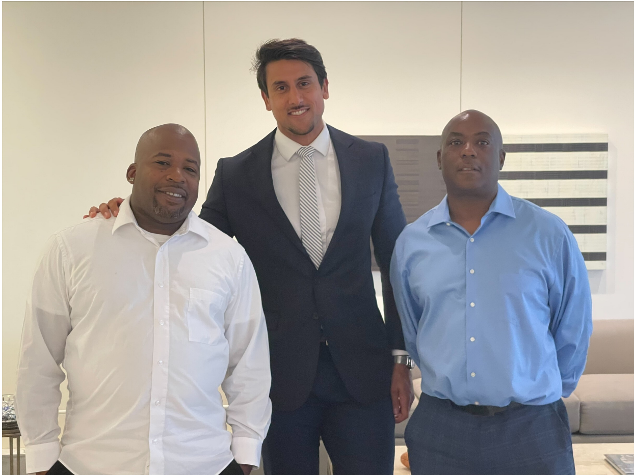
From left: our client, former San Francisco Associate, and our client's uncle.

Learn more about Winston's commitment to excellence in serving the public interest and our Racial Justice & Equity CEASE Initiative.