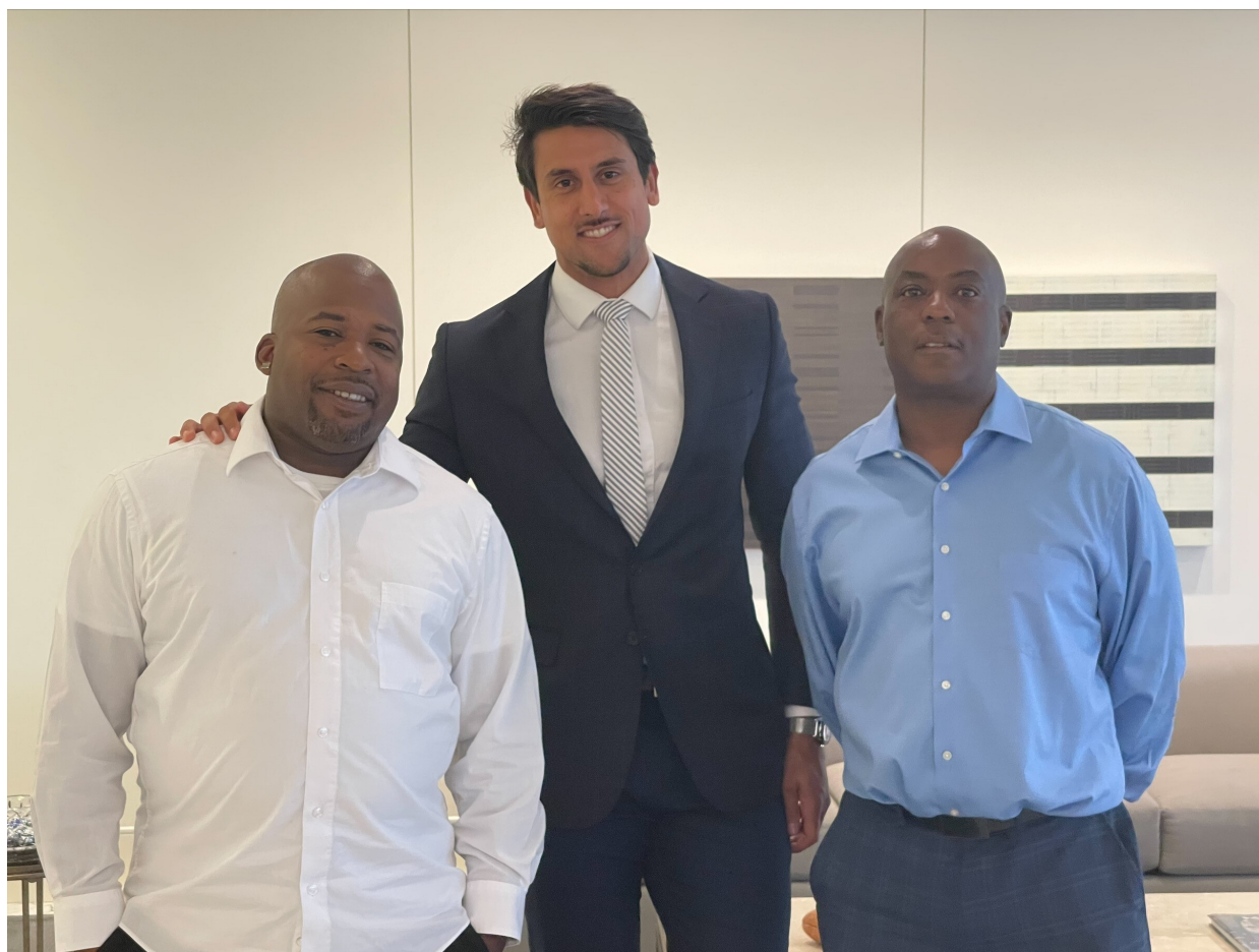
From left: our client, former San Francisco Associate, and our client's uncle.

Learn more about Winston's commitment to excellence in serving the public interest and our Racial Justice & Equity CEASE Initiative.