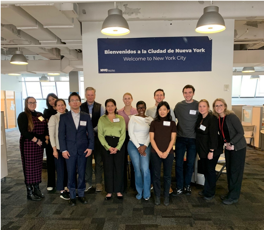
The Winston/Cisco team at the Asylum Application Help Center